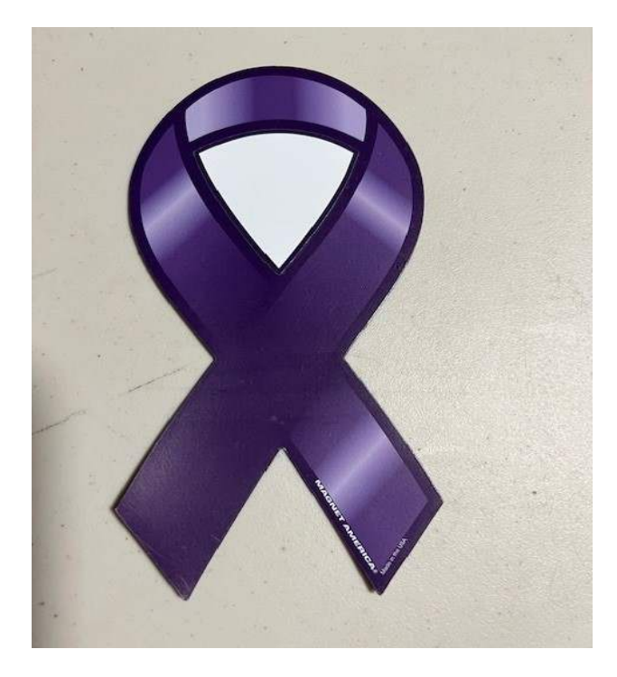
RIBBON CAR MAGNET $6.00