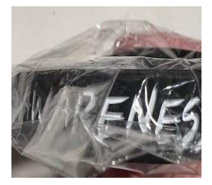
BLACK AWARENESS BRACELET $2.00