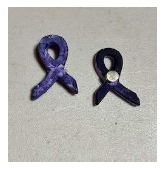
CERAMIC RIBBON MAGNET $4.00